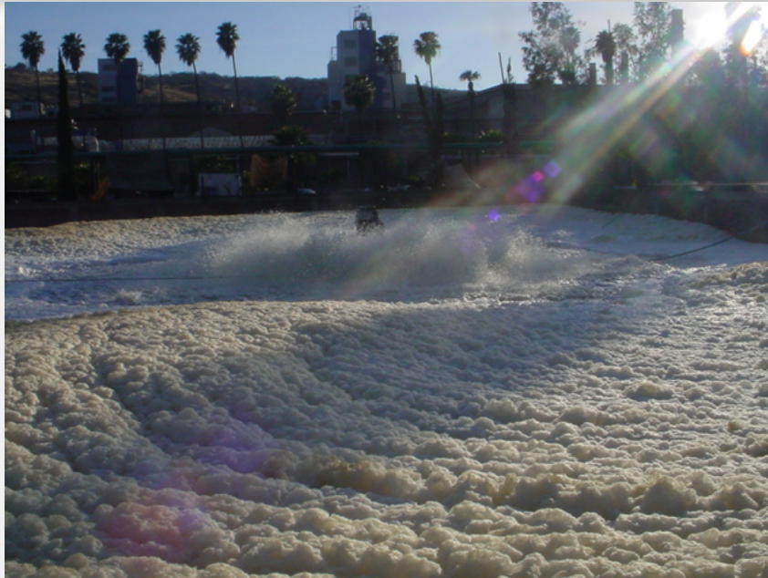
No N and P Before