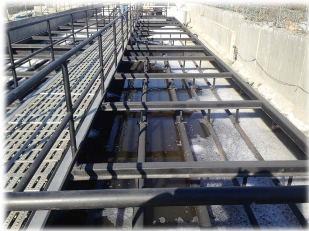
Before and After Bioaugmentation