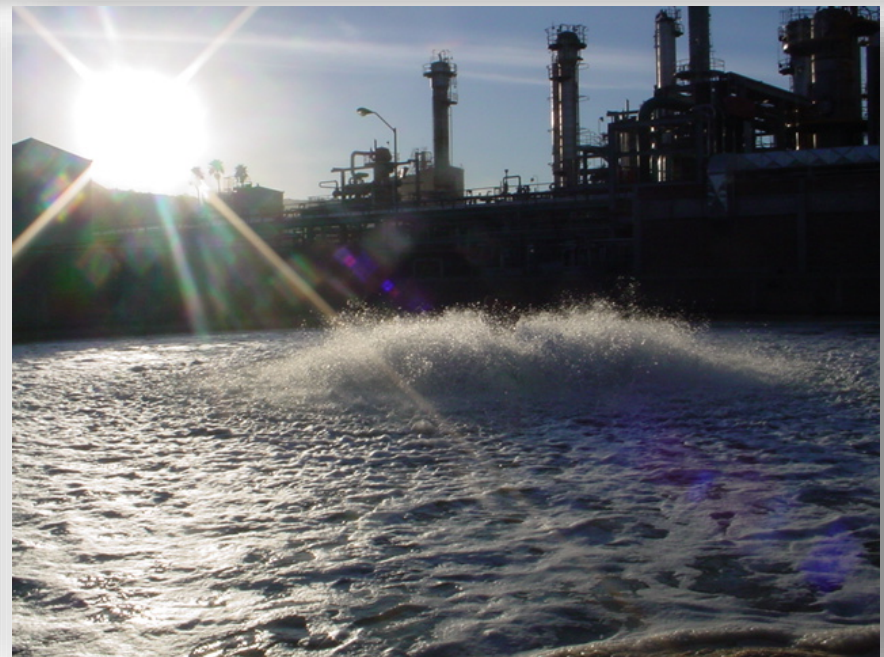
24 hours after Nutrients and Bioaugmentation