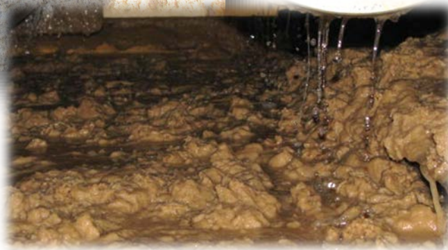
Foaming in Aeration basin, Zooglea on belt press