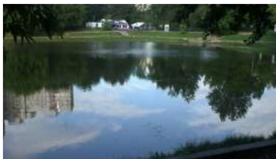
Before and After photos