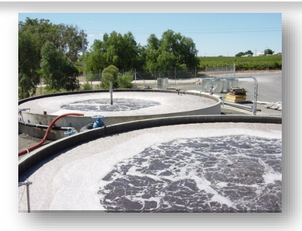
Audit, training, nutrient addition and bioaugmentation