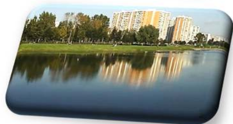
Top before & bottom picture after Remediation