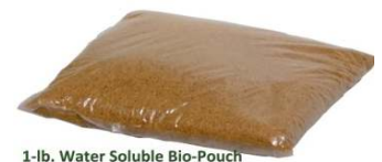
1-lb. Water Soluble Bio-Pouch