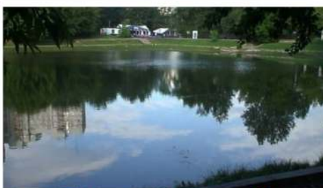
Bottom 2 pictures After Environmental Leverage's MicroClear® products Added